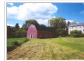
Higgins Barn 87 Pillsbury Road