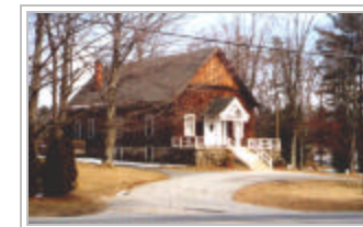
Grange Hall No. 44 260 Mammoth Road