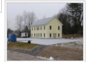
White Birch Fine Art 8 Mohawk Drive